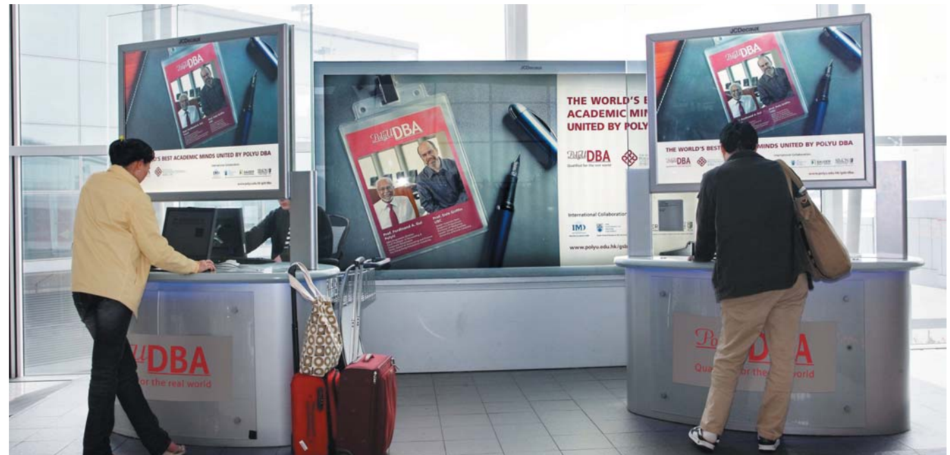
*Mockup only, not on actual scale