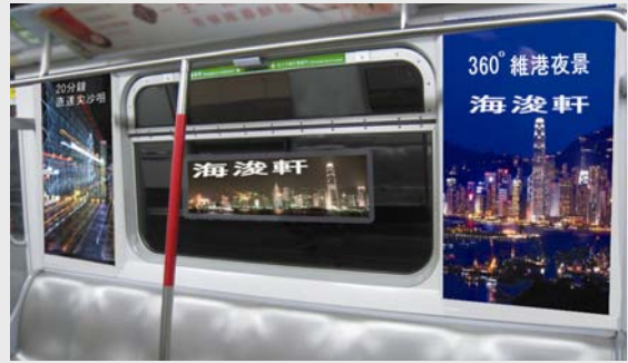
Mock up for reference only

Book now to enjoy exceptional advertising effectiveness! Enquiry hotline: 2111 0111 | Email: info@jcdecaux.com.hk Website: www.jcdecaux.com.hk