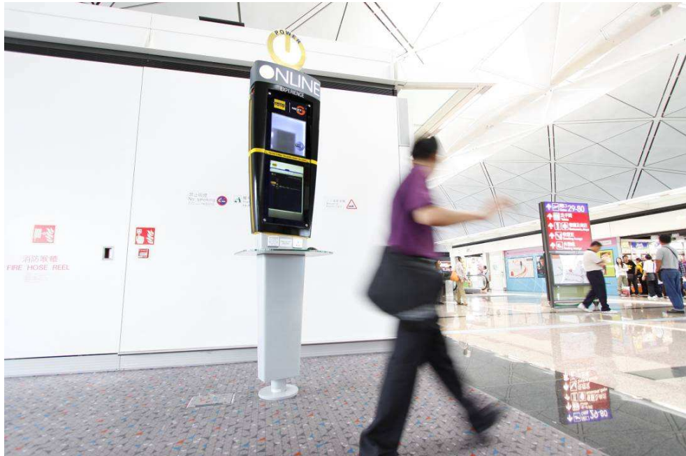
The first Power Pole at Hong Kong International Airport (Located at Departure Central Concourse)