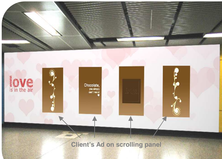
6-sheet Scrolling Unit with JCD panel extension